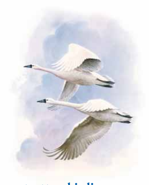
The older whistling swan shows initiative by taking the lead in a flock's "V" formation. As other swans follow the leader's example and take turns breaking the wind, a flock is able to fly 30 percent farther than if each swan flew alone.